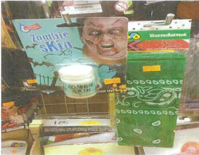
PHOTOGRAPH 3 AND 4 OF "ZOMBIE SKIN"